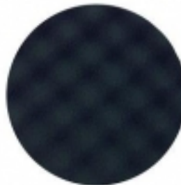
3M™ Perfect- It™ Foam Polishing Pad