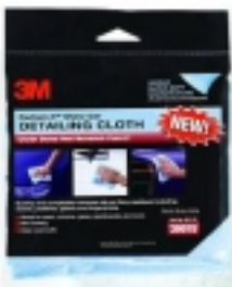
3M™ Perfect-It™ Show Car Detailing Cloth