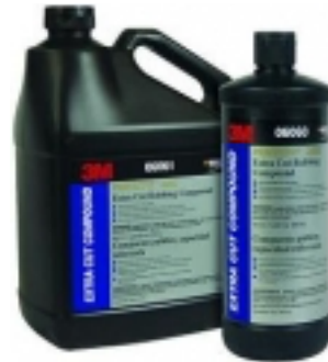
3M™ Perfect-It™ #06060 Extra Cut Rubbing Compound Qt.