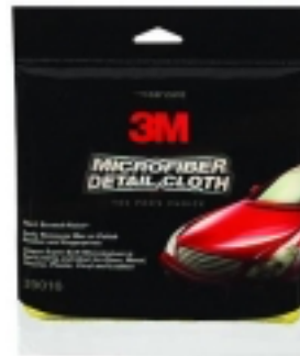
3M Microfiber Detail Cloth Clip Strip (39016) 12 in x 14 in; 1/p