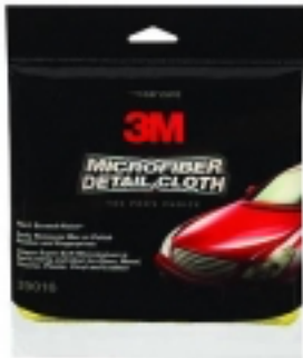
3M Microfiber Detail Cloth Clip Strip (39016) 12 in x 14 in; 1/p