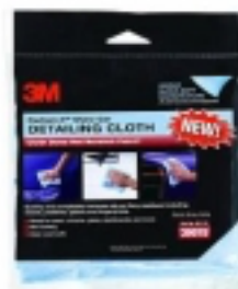
3M™ Perfect-It™ Show Car Detailing Cloth