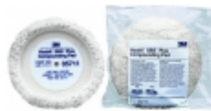
3M™ Wool Compounding Pad