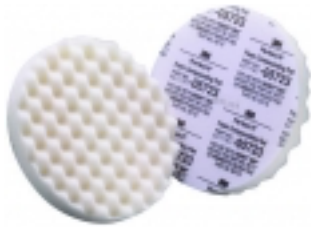
3M™ Foam Compounding Pad