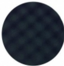
3M™ Perfect- It™ Foam Polishing Pad