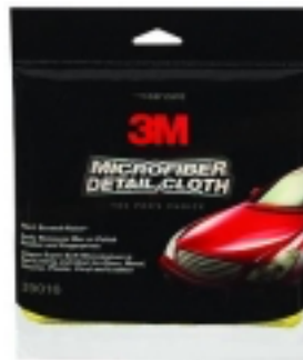
3M Microfiber Detail Cloth Clip Strip (39016) 12 in x 14 in; 1/p