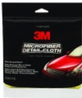
3M Microfiber Detail Cloth Clip Strip (39016) 12 in x 14 in; 1/p