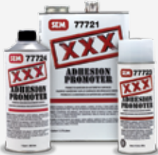
3986( ) PLASTIC ADHESION PROMOTER or 7772( ) XXX ADHESION PROMOTER