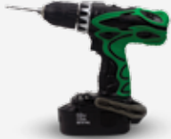
Drill with 1/8" bit