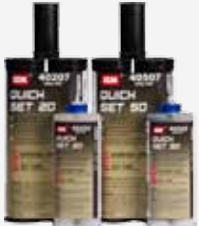
4020( ) QUICK SET 20 or 4050( ) QUICK SET 50