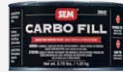
39542 CARBO FILL