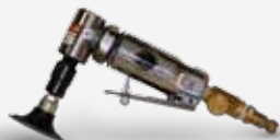
Grinder with 36-40 grit disc