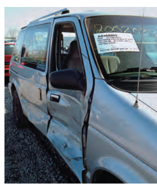
48" Collision WRAP covers open side of vehicles