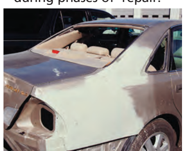
Collision WRAP for Sitting vehicle in phases of repair!