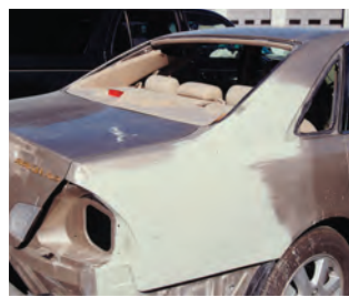
Collision WRAP for sitting vehicle in phases of repair.