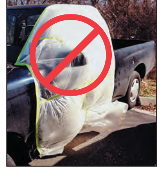
Eliminate jerry-rig attempts to cover crash damaged vehicles sitting outdoors awaiting repair.