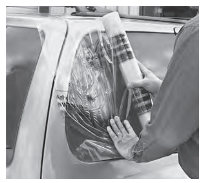
24" width covers side windows in one strip.