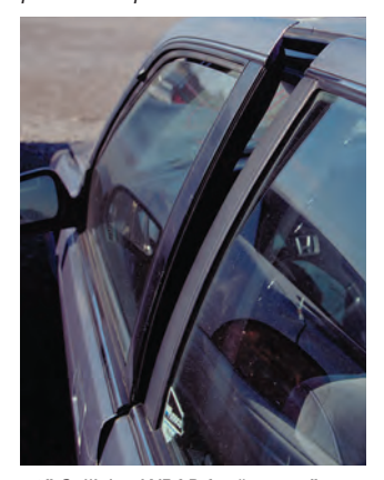
18" Collision WRAP for "sprung" doors.