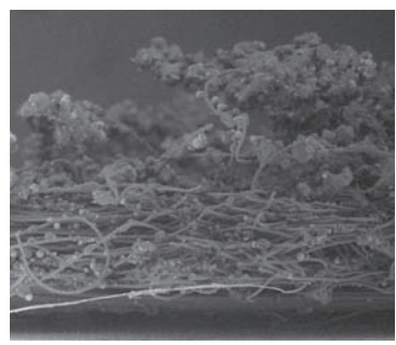
BUILD-UP OF TRAPPED DUST, DIRT AND OVERSPRAY.

3M has taken the simple concept of surface protection and revolutionized it to enhance your painting process. Not only is the 3M^{TM} Dirt Trap Protection System great for surface protection, but a closer look reveals a breakthrough innovation that actually traps dust, dirt and overspray in a unique non-woven construction.